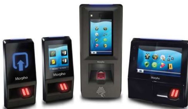
THE SIGMA FAMILY