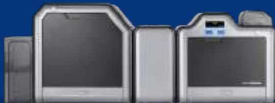
Dual-side printer with lamination