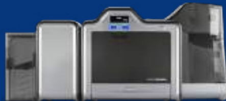
Dual-side printer with dual input hopper